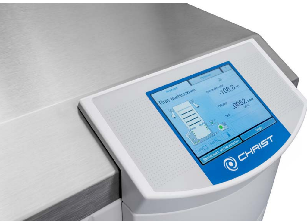
Alpha 3-4 LSCbasic