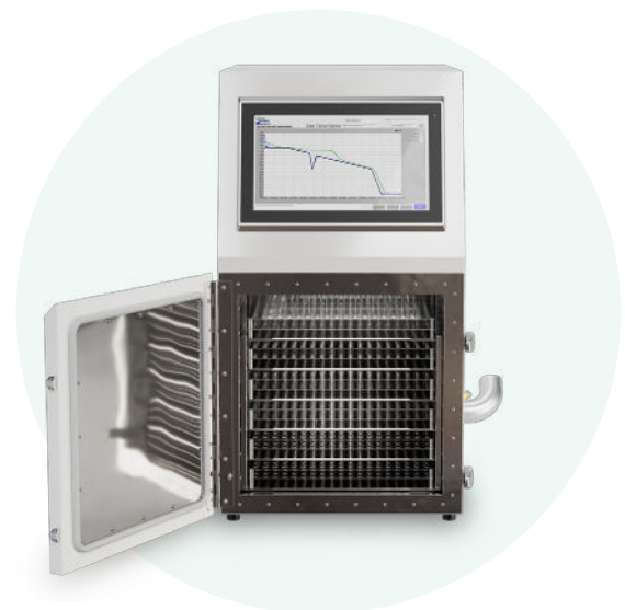
INTERIOR VIEW 67-liter (2.35 cu. ft.) volume inside the chamber