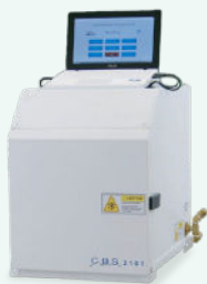
2101 Controlled Rate Freezer 28-Liter Capacity