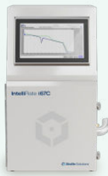
IntelliRate i67C Controlled Rate Freezer 67-Liter Capacity