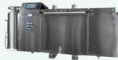
High Capacity Controlled Rate Freezer Up to 781-Liter Capacity