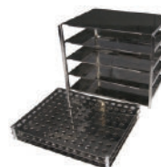
1.2ml/2ml Vial Rack Holder (Capacity - 5 Racks 650 Vials)