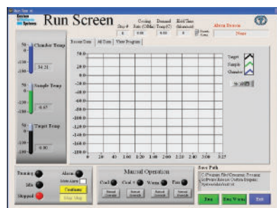
Run screen provides all details of actual freeze runs during operation, plus all manual override controls.