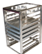
Bag Canister Rack (Capacity - 10-20 Canisters)