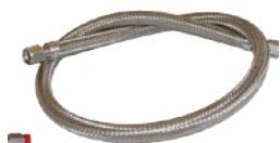
LN2 Transfer Hose