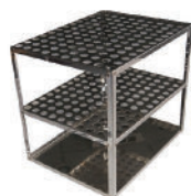
Cane Rack (Capacity - 130 Cans)